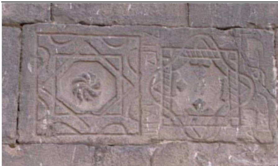
The origin of the flag of Western Armenia Republic (Dikranagert)