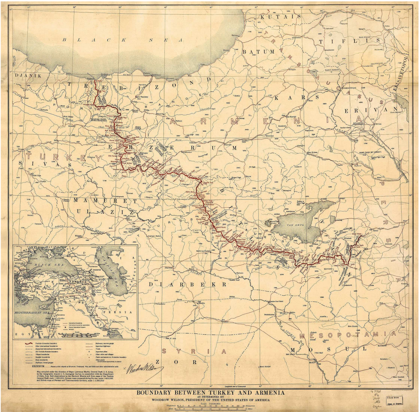
Armenia refers to the boundary configuration of the State of Armenia in the Treaty of Sèvres, as drawn by U.S. President Woodrow Wilson's Department of State, the November 22, 1920